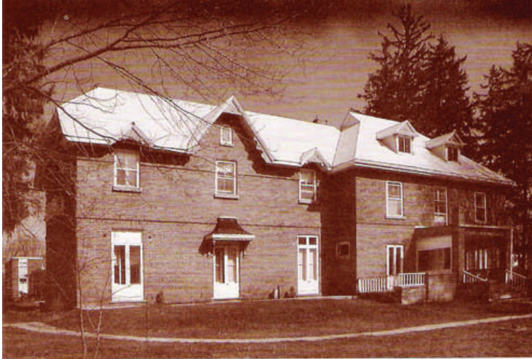
5 55 Peel Street