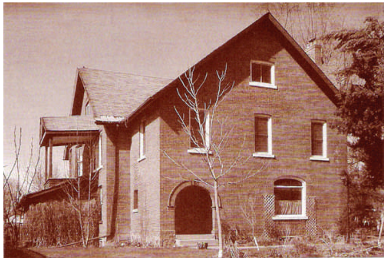
6 168 Owen Street