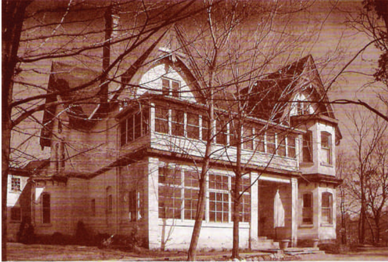
7 101 Clapperton Street