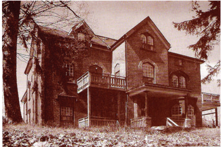
8 5 Wellington Street East