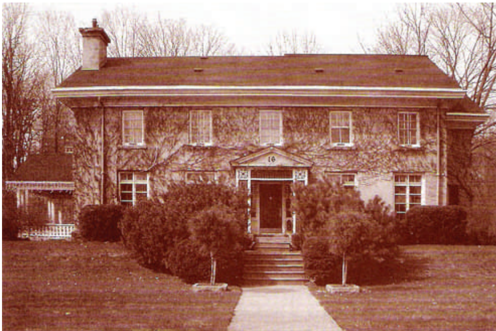
1 16 Blake Street

As the centre of commerce and county government, Barrie was the location of choice for many prominent families in the nineteenth and early twentieth centuries. Their stylish homes survive along street-scapes or tucked away from view as the once large estate lots are carved into smaller parcels. The Grand Homes Tour presents a few of the finer and more interesting historic dwellings in Barrie. Some of the selections are in near original condition, while others will need your imagination to envision their former splendour. They represent only a small portion of Barrie's architectural heritage.