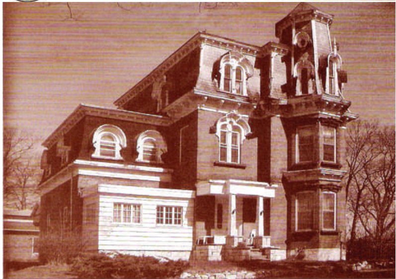
15 25 Valley Drive