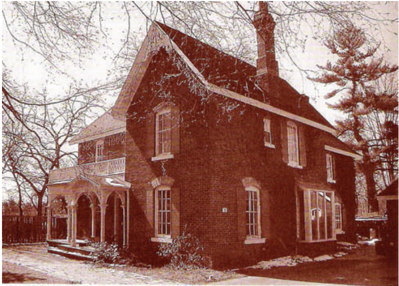
14 11 Letitia Street